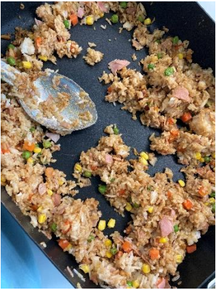
Yummy fried rice for snack.