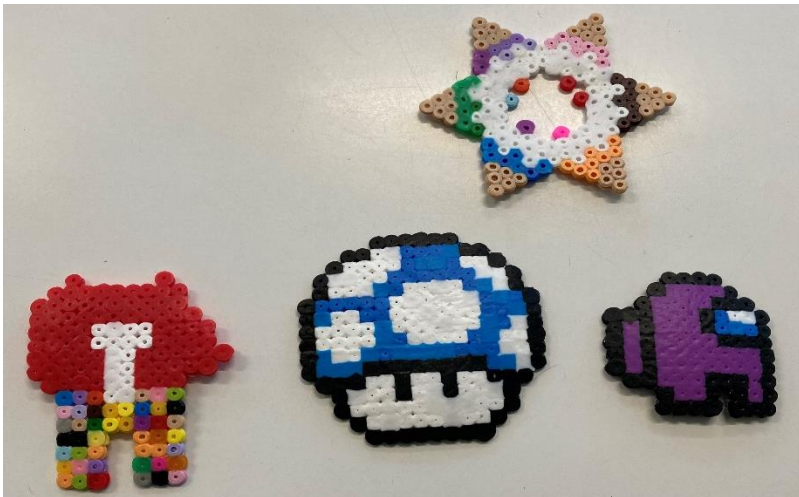
Our new FAVOURITE activity