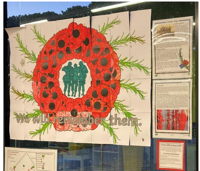
Our poppy wreath Collaboration art piece