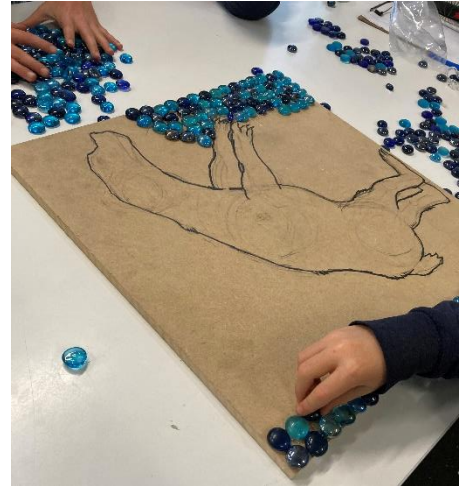
Creating our polar bear