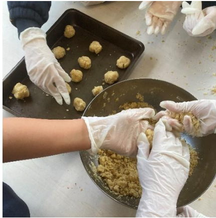
Making Anzac Biscuits