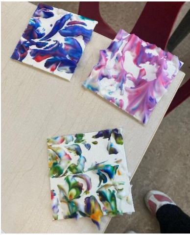
Shaving Foam Art